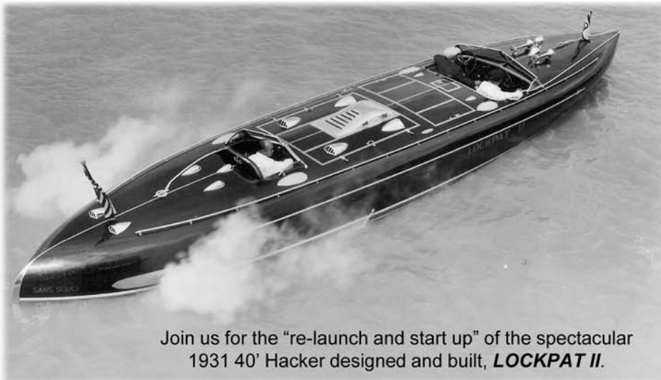
Join us for the "re-launch and start up" of the spectacular 1931 40' Hacker designed and built, LOCKPAT II .

Featuring: Hacker boats – "the usual and unusual" - production, custom and race boats -