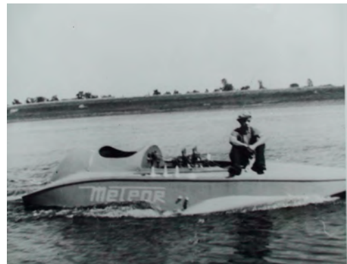
“Meteor”