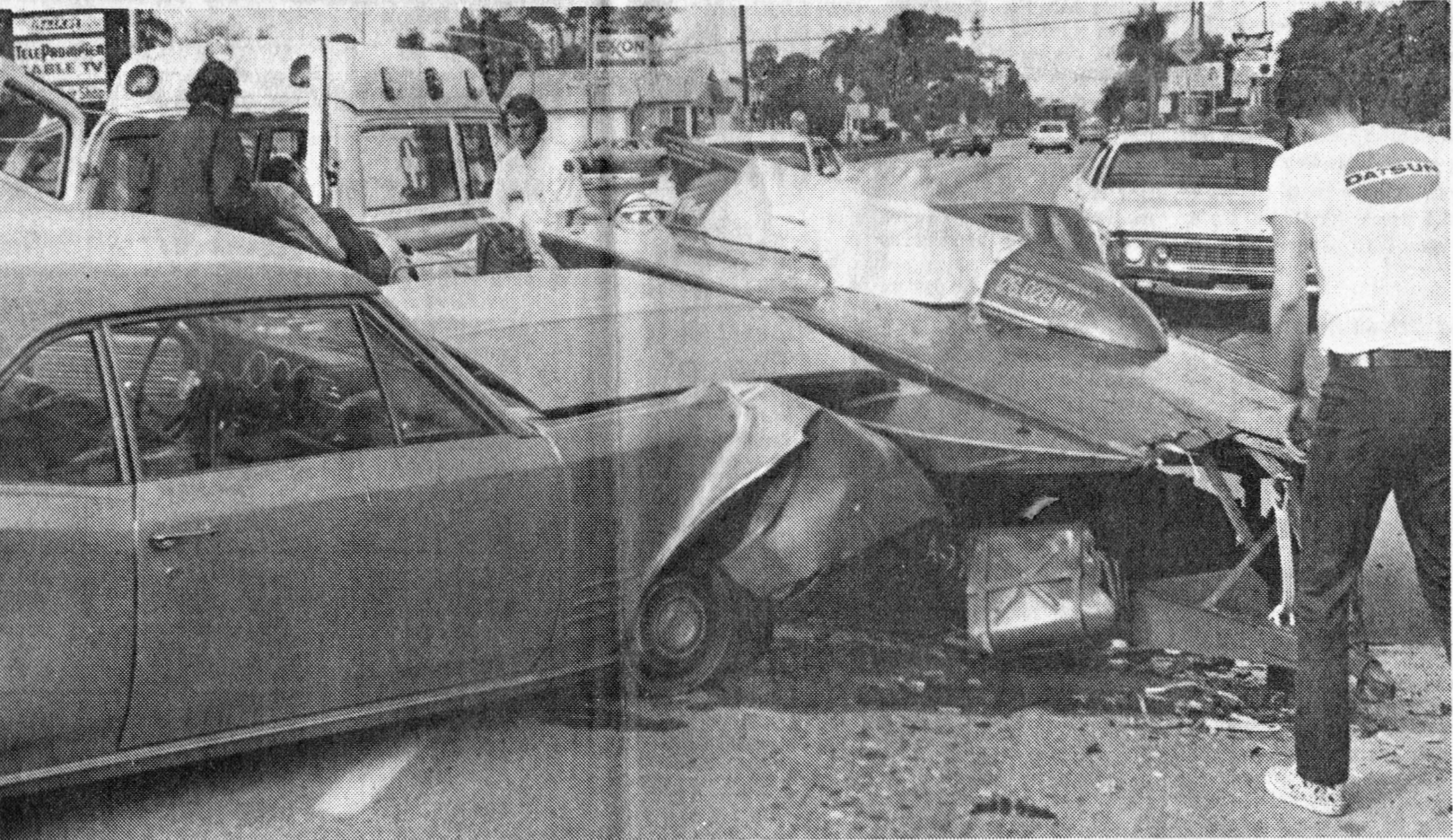
Hydroplane Trailer Disconnected And Rolled Into Path Of 1966 Pontiac . . .