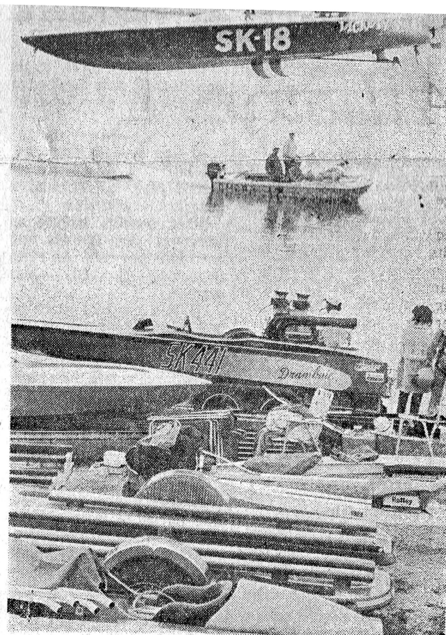
SK-18 Lowered into Water at Pit Area